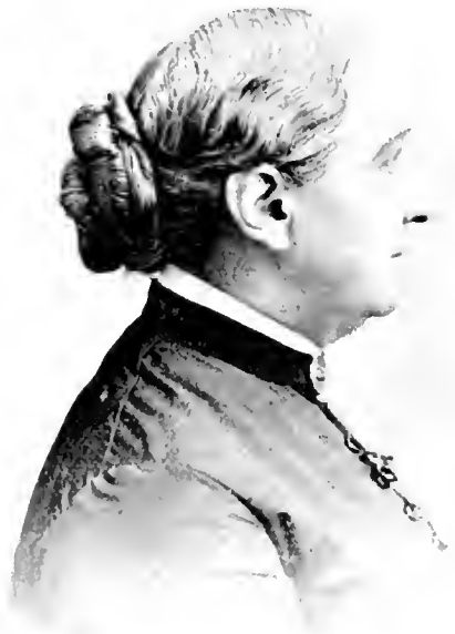
ANTOINETTE BROWN BLACKWELL.

by persistent work has she been able to accomplish so much for herself and others. Although a wife and the mother of several daughters, she has kept abreast of the times on the questions of science, art